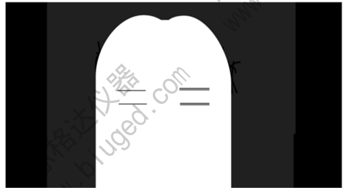
Test Method B: Ratio of Cycles to Failure of Test Paint and Reference Paint