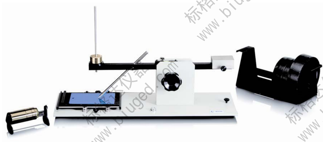
FIG. 1 Balanced-Beam Scrape-Adhesion Tester