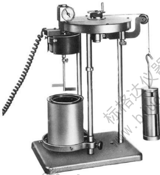
FIG. 1 Stormer Viscometer with Paddle-Type Rotor and Stroboscopic Timer

9.3 When the temperature of the specimen has reached equilibrium, stir it vigorously, being careful to avoid entrapping air, and place the container immediately on the platform