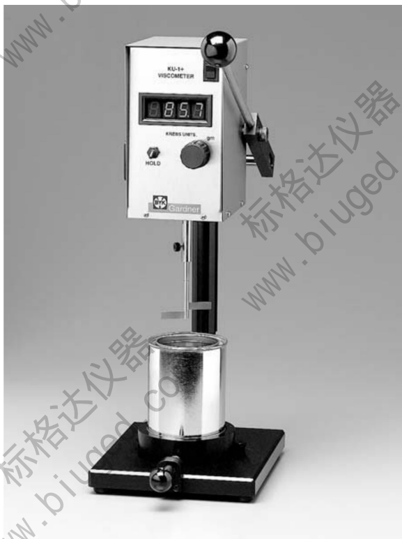
FIG. 5 Digital Stormer-Type Viscometer

15.2 Suitable Hydrocarbon Oils, calibrated in KU and traceable to NIST, available commercially.