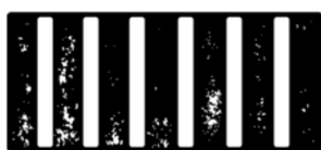
FIG. 3 Stroboscopic Lines Opening When Timer is Adjusted to Exactly 200 r/min

11.1.3 If desired, determine from Table 1 the KU corresponding to the load to produce 100 revolutions in 30 s.