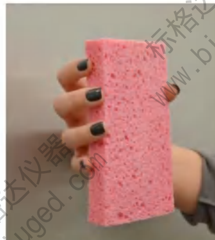
FIG. A2.2 Holding Sponge Vertically

A2.5 If the criterion in Step 4 (A2.4) is not met, a new source of sponge material must be obtained for testing.