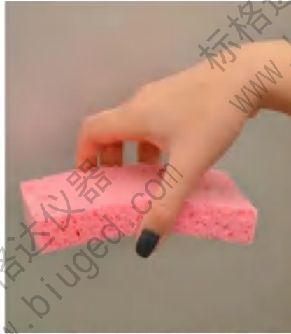
FIG. A2.3 Holding Sponge Horizontally